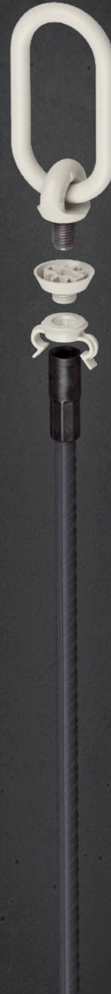
Example: type SR 16