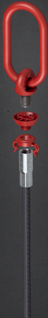
Example: type RD 16